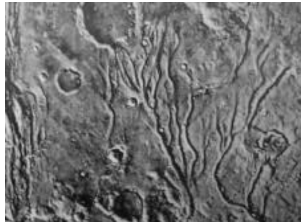
Fig.1. Valleys networks on Mars. Scene is 200 km wide. (Viking Orbiter mosaic).

Meanwhile, the morphology of many martian small valley networks has been recognized as presenting several unusual, “seemingly non-fluvial” characteristics [2]. The following combination of traits are distinctive: i) the networks are spaced apart with large undissected areas between networks, ii) the networks display open, branching patterns with large undissected areas between branches, iii) branches often have ill-defined sources but mature in width and depth over short distances relative to the size of the network, iv) branches maintain relatively constant width and depth over long distances, v) branches split and rejoin to form steep-walled islands, vi) branches have U-shaped cross-sections with steep walls and flat floors, vii) channels on valley floors are absent or poorly expressed. Their scale also varies by over an order of magnitude [Fig.1].