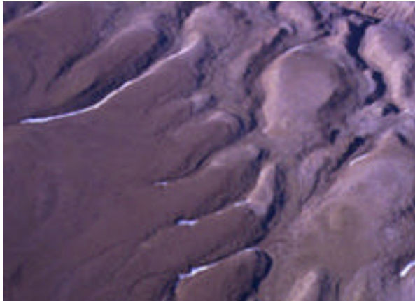
Fig.3. Aerial view of subdued forms of meltwater channel networks on Devon Island. Scene is 2 km across (Photo HM98-0718-160,).