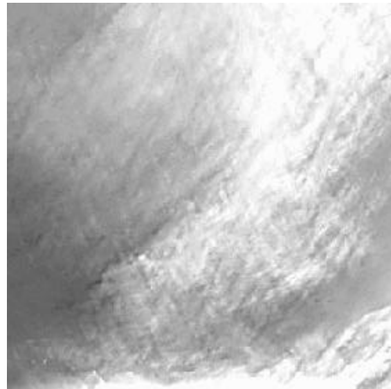
Figure 1: Noachis dust storm and associated activity near the edge of the seasonal south polar cap.

encircling event during its first aerobraking phase in 1997 [6,7] (Figure 1). This storm started roughly at L_S = 225^\circ , at its maximum extent extended from -25^\circ to -65^\circ latitude and from 320^\circ to 15^\circ longitude, and had measured IR opacities in excess of unity. It was accompanied by elevated planetary opacities but faded to essentially pre storm conditions by L_S = 235^\circ . The Thermal Emission Spectrometer (TES) observed a second regional storm in the region to the north and northwest of Aryre during summer, L_S = 309^\circ , a period when the Mars Orbiter Camera (MOC) could not view the Southern Hemisphere [8].